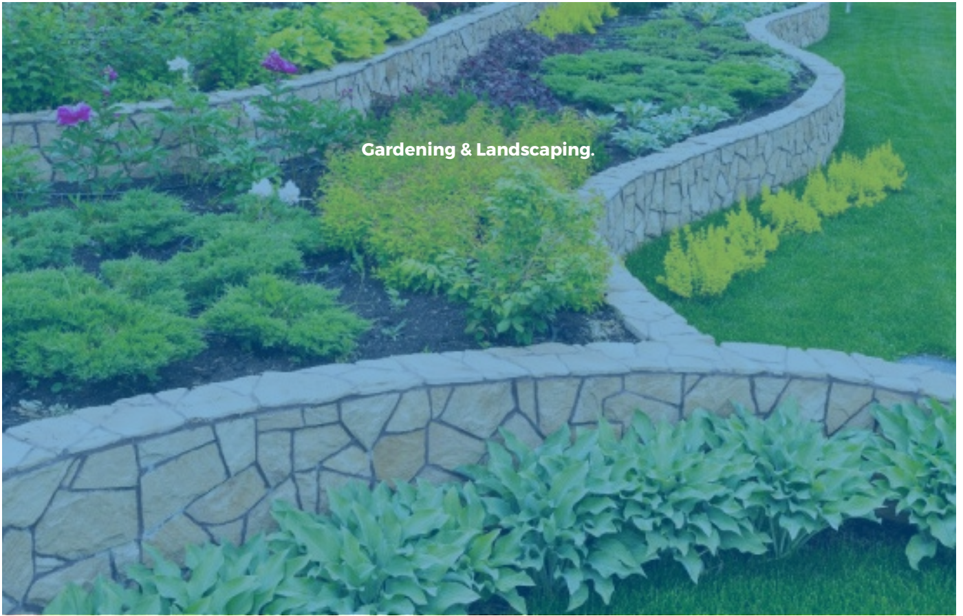
Gardening & Landscaping.