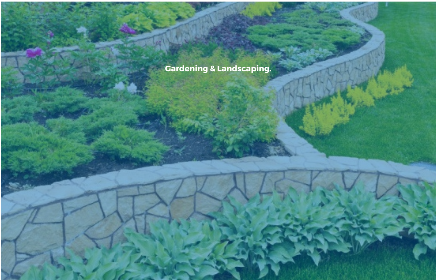
Gardening & Landscaping.